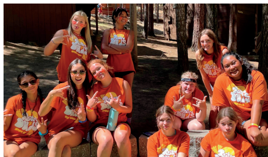
Northpark Youth at Summer Camp at Hume Lake